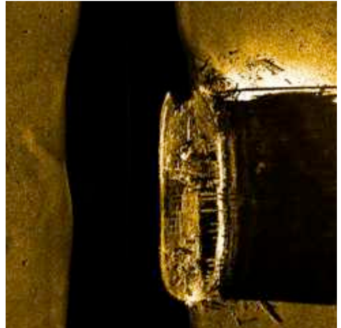
Sonar image of the shipwreck