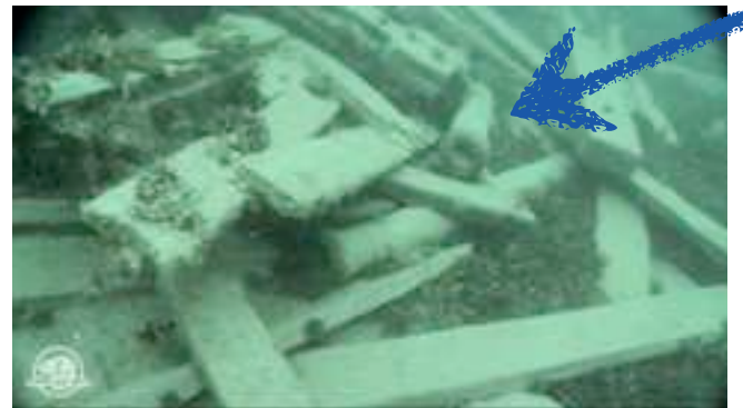
Canons on Franklin ship underwater