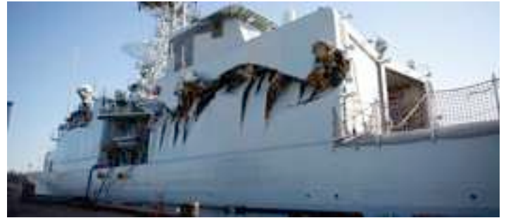
HMCS Algonquin post-collision