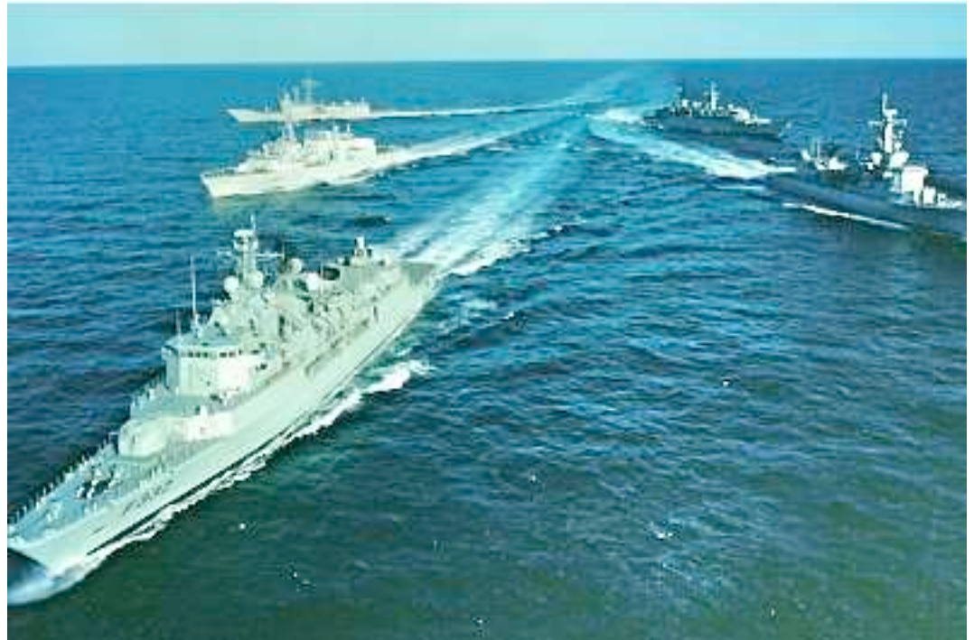
NATO warships just prior to entering the Black Sea Sept. 7: US Navy destroyer USS Ross, HMCS Toronto, Commandant Birot ship of the naval forces of France, and Spanish frigate Almirante Juan de Borbon.