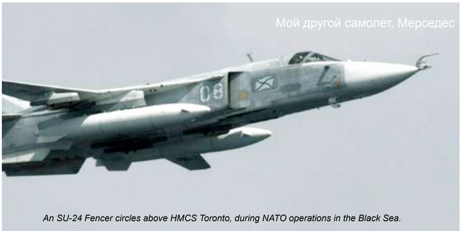
An SU-24 Fencer circles above HMCS Toronto, during NATO operations in the Black Sea.