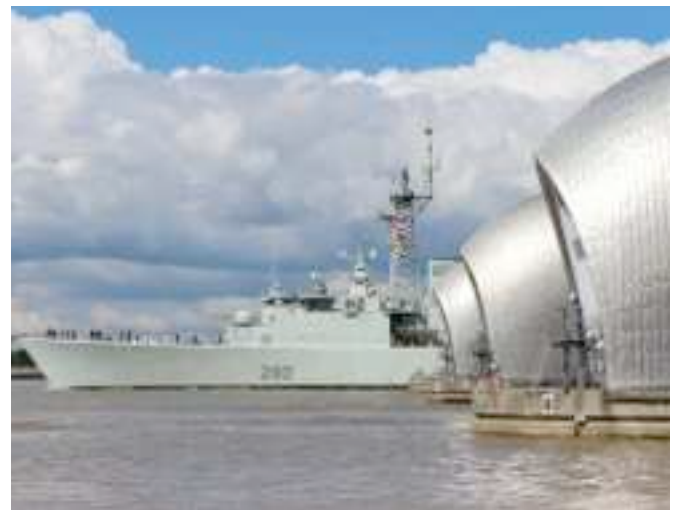
HMCS Iroquois in happier times, passing through the Thames Barrier

HMCS Preserver was scheduled for retirement in 2016 but discoveries of extensive corrosion near the boiler room means a near-term pay off instead