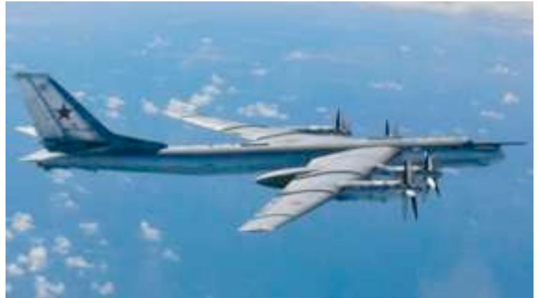
Tu-95 long-range bombers, or 'Bears' have flown hundreds of missions on the perimeter of our airspace.

More recently two CF-18s intercepted two bear bombers over the Beaufort Sea. Although the Russians did not enter sovereign airspace, Norad reported that they did come within 75 miles of Canadian land which puts them well within Canada's Air Defence Identification zone. Six hours prior to this encounter, American jets scrambled from a base in